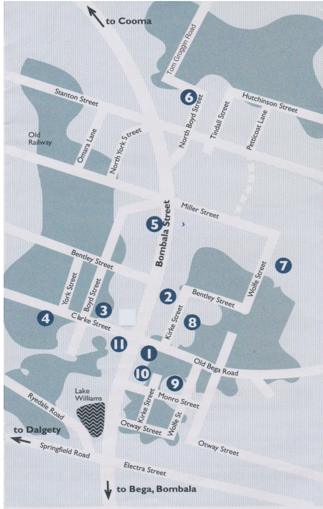
NIMMITABEL POLICE STATION