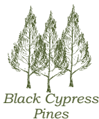
Black Cypress Pines

It was named in Honour of Stephan Endlicher (1804-1849) – an Austrian Botanist.